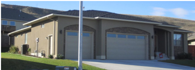
Average + Quality / 2013 / 2,032 square feet