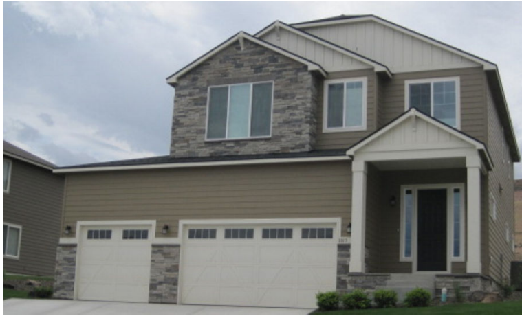
Average Quality / 2014 / 2,545 square feet