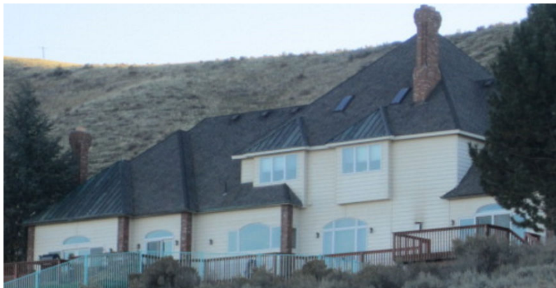
Good Quality / 1994 / 5,961 square feet